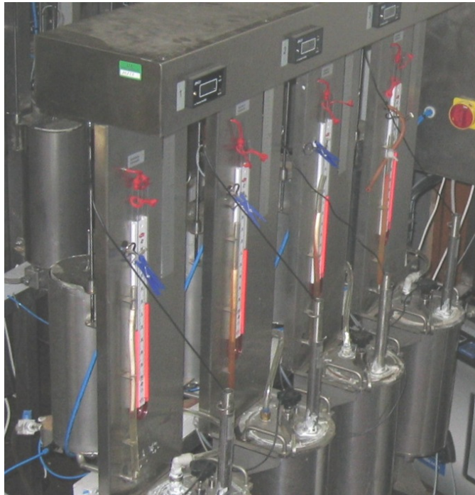
Fig. 1. Laboratory digesters for investigation of biogas from biomass

Chicken manure with sawdust litter was filled in the digester D1 (Table 1) and chicken manure (with sawdust litter) mixture with slaughterhouse waste was used in the digester D2. Mixtures of fresh sawdust with water were filled in digesters D3 and D4, and old sawdust mixtures with water were filled in digesters D5 and D6. Grain mill waste mixtures with water were used in digesters D7 and D8. Fermented cow's manure was added to all digesters in the ratio of 24 % to 35 %, to provide methanogenous microbial inoculum for a successful anaerobic fermentation process (Table).