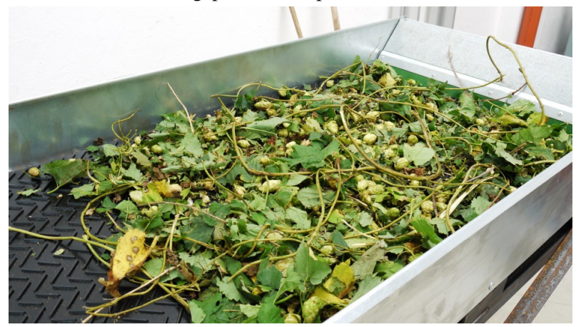
Fig. 2. Sample of material evenly spread on the conveyor belt

The dependency of hop material fall through on the gap size between rollers was measured gradually for four gap sizes between the rollers (48, 53, 58 and 63 mm). The measurement was repeated five times for each gap size. A sample of hop material was each time used only for one set of the measurements. To measure another gap a new sample was used.