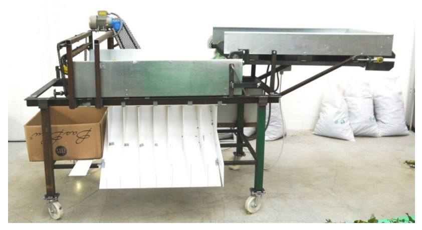
Fig. 1. Model of roller conveyor

machine is the first of its kind in the Czech Republic, it is still under development and its production will be provided by the Machinery Plant of Chmelařství, cooperative Žatec. The model has 9 rollers altogether of 60 mm in diameter. The rollers are 600 mm long. The first roller is fixed to the frame, whereas it is possible to infinitely adjust the pitch of the remaining 8 rollers, thus changing the gap size between them. The space bellow the rollers was divided by means of KAPA boards, so that we were able to determine the amount of the hop material fallen through the rollers. The input of hops is provided by a belt conveyor which is 600 mm wide and 1000 mm long.