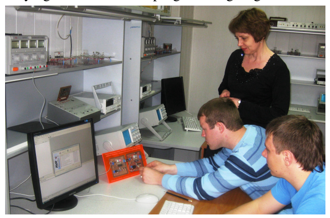
Fig. 2. Using Microcontroller's test bench in practical classes

Hardware-software unit of LO consists from the developed programs and hardware for their realizations – Microcontroller's test bench [13]. The test bench is designed in two modules with digital and analog inputs. Each module has a slot for programming microcontroller with the help of AVRISP mkII programmer. The main purpose of the hardware-software unit of LO is realization of the practical component in studying Microcontroller programming, Figure 2.