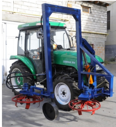
Fig. 1. General view of ANAU spinharrow

Unlike similar machines listed above, the developed machine does not have a hydrosensor that is used for bypassing a vine. In this case, vines are bypassed with the help of a rubber bezel, which upon coming into contact with an obstacle or a vine rolls down it freely and guides the operating element out of the space between the bushes. After bypassing the obstacle using a spring of appropriate stiffness and the reactive force of the blades, generated as the result of cutting soil, the operating element gets back into the space between the bushes.