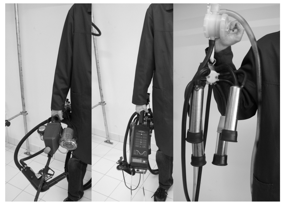
Fig. 1. Milking machines in experiment

Three milking machines were tested in laboratory conditions by using a test rig. The height of the milking pipeline was 1.86 m and the height of the vacuum pipeline was 1.93 m. The following milking machines were chosen for testing (Fig. 1) – Duovac (7.4 kg), MilkMaster (7.5 kg), and ADU1 (4.0 kg). The milking machines vary by the design and mass, so it is expected that the differences have some impact on the workers' ability to perform the tasks. In order to achieve more genuine simulation of the milkmaid's work additional mass (bucket containing udder cleaning equipment) of 3.2 kg was used.