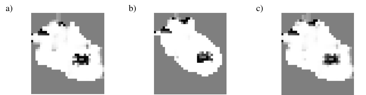
Direct cell comparison – 0.959 The proposed approach – 1.000