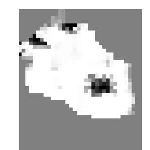
Direct cell comparison – 0.926 The proposed approach – 1.000

Direct cell comparison – 0.904 The proposed approach – 0.989