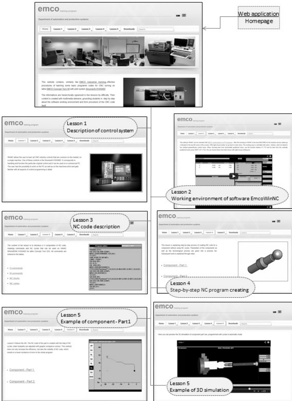
Fig.4 Example of Web application structure and screenshots of “emco training program” for control Sinumerik 840D – Turn