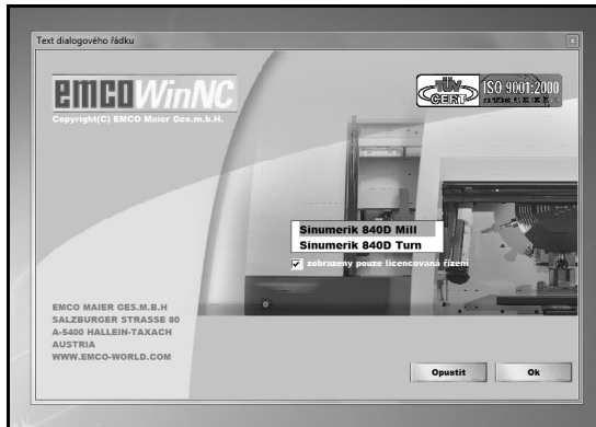
Fig. 2. Screen of software EmcoWinNC

accompanying tool for the theoretical part of the lectures and courses. Application is available for students and is located at department Website. The content of the whole Web application is divided into two parts for the turning and milling machine EMCO separately. Because of the specified length of the article, in the text only the structure and the principle of the part that describes Web support application for control Sinumerik 840D – Turn (Fig. 4) will be mentioned. This part of the Web site is directly connected to the part – “ EMCO Concept TURN E55 ” (Fig. 3) which contains information about the machine, its design, technological characteristics, and so on.