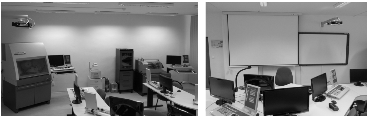
Fig. 1. Laboratory of CNC Machines Programming and PC with control panels

The Department of Automation and Production Systems has a good experience with creation of multimedia learning programs for several years. Multimedia educational support programs are solved and developed in the frame of many research activities. The main areas of their utilization and application are mainly CNC machines and their programming, utilization of modern CAD/CAM systems, programming and application of industrial robots and manipulators, etc. At the department the education of courses for CNC machine programming is taking place in the new “Laboratory of CNC Machines Programming” [1].